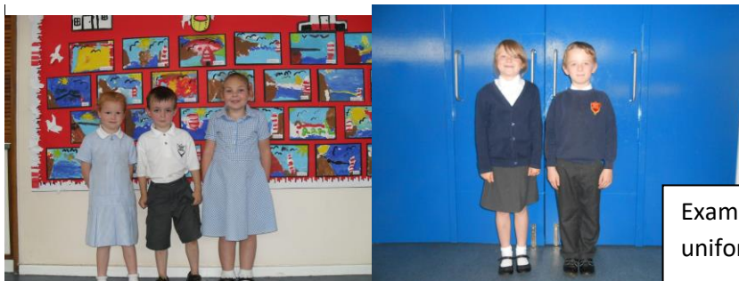
Examples of our winter and summer uniform.

In summer girls may wear a navy checked summer dress and boys may wear grey shorts and polo shirts. Children are encouraged to wear school shoes rather than trainers.